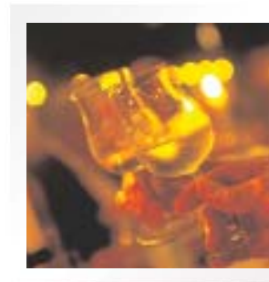
Taste local wines

Day 6, VIENNA. A wonderful day to savor the baroque romance of Vienna. On your guided sightseeing tour, you will see the lavish Hofburg Palace, the impressive Vienna Opera House, the