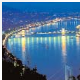
Budapest by night