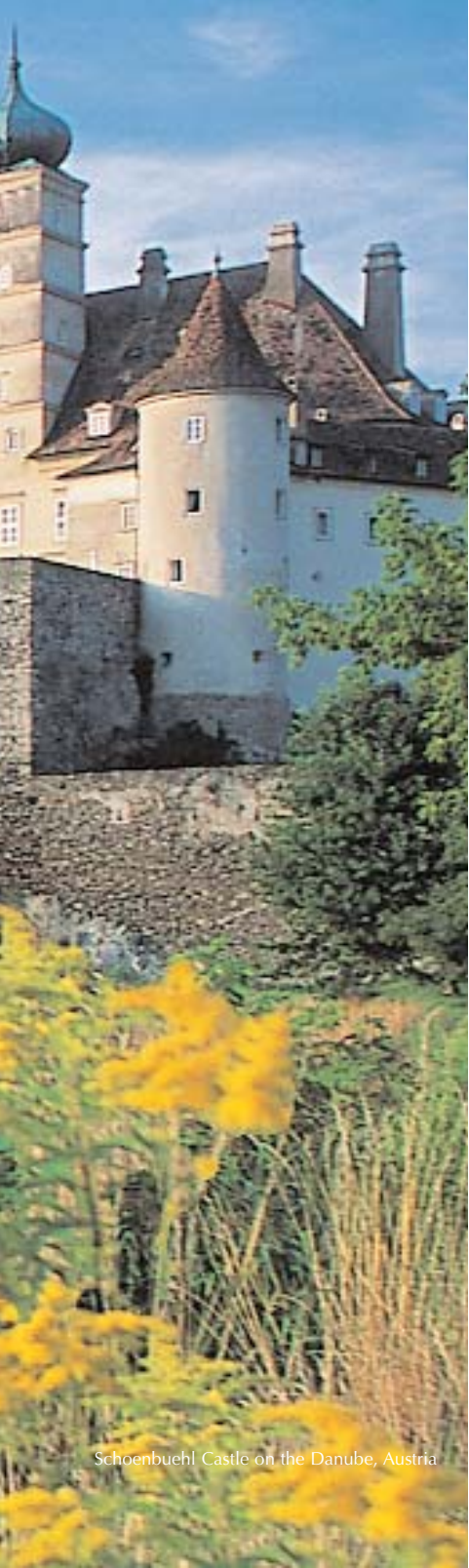
Schoenbuehl Castle on the Danube, Austria