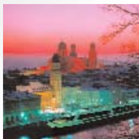
MS Amadagio in Passau

*Note the NAFYR Cruise is from Budapest to Nuremberg only. The optional 4 day pre and post land package is available for an additional $775.