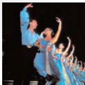
Enjoy a free evening at the ballet